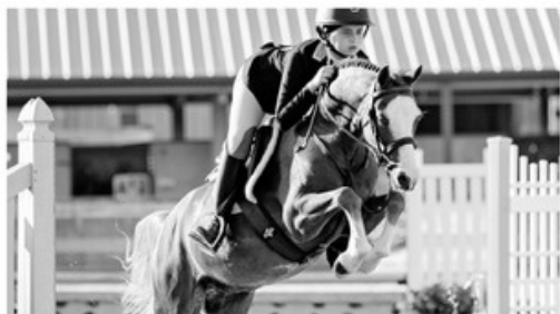
Forever After All